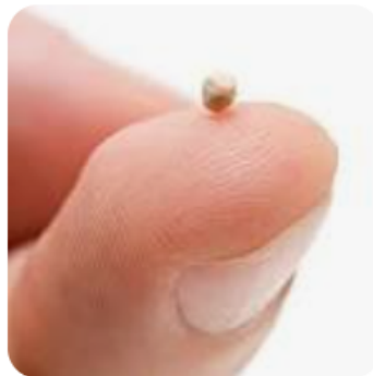
Mustard Seed Symb...