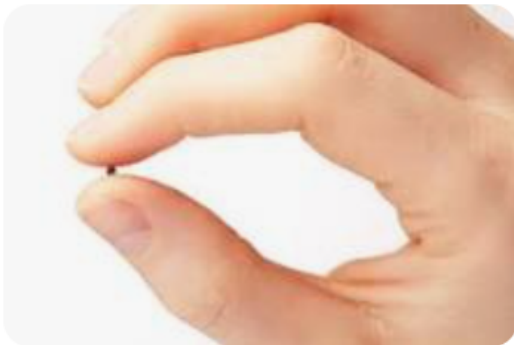
Mustard Seed Hand Images – Br...

So even just a little bit of faith can often be strong enough.